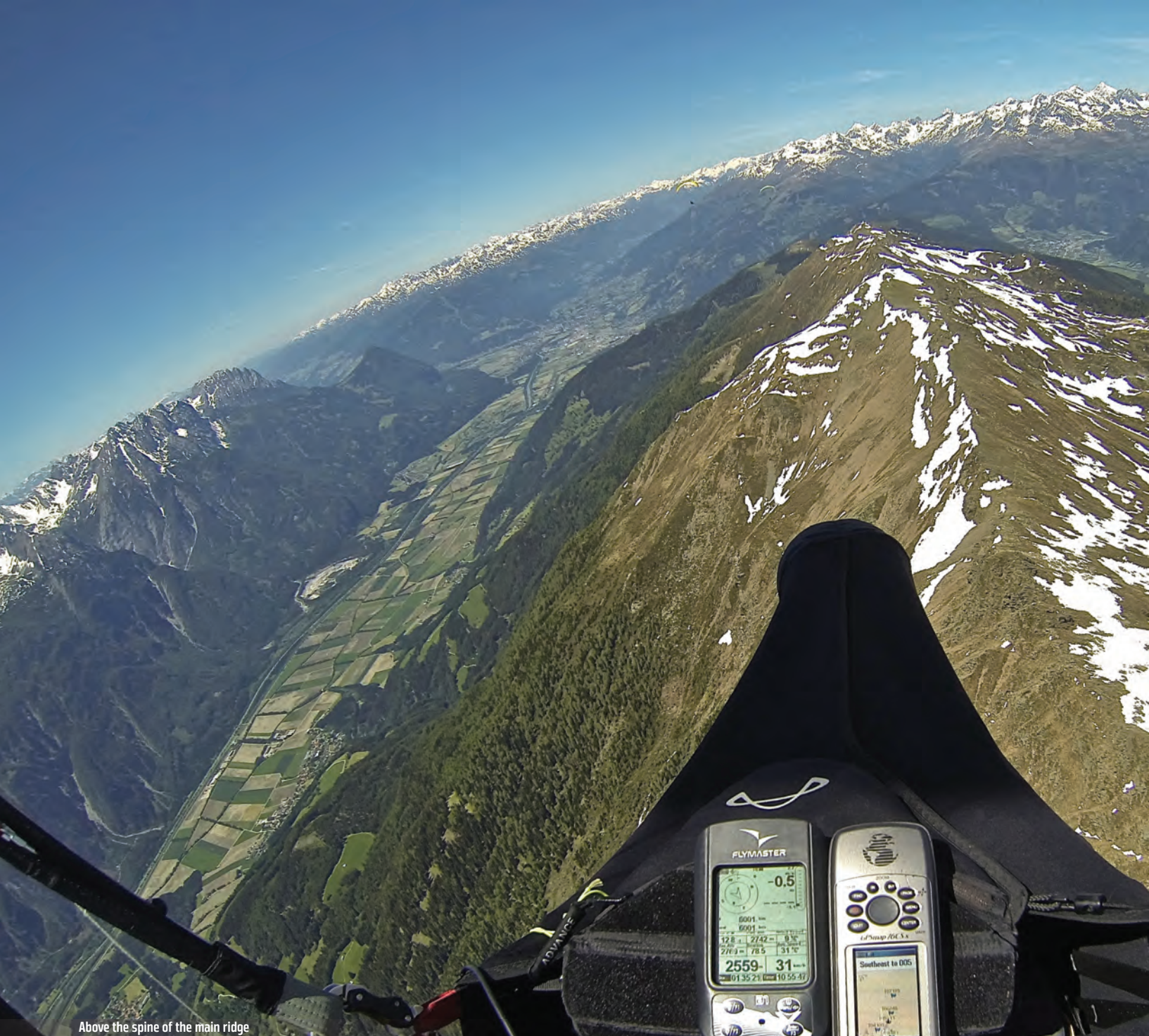
Above the spine of the main ridge