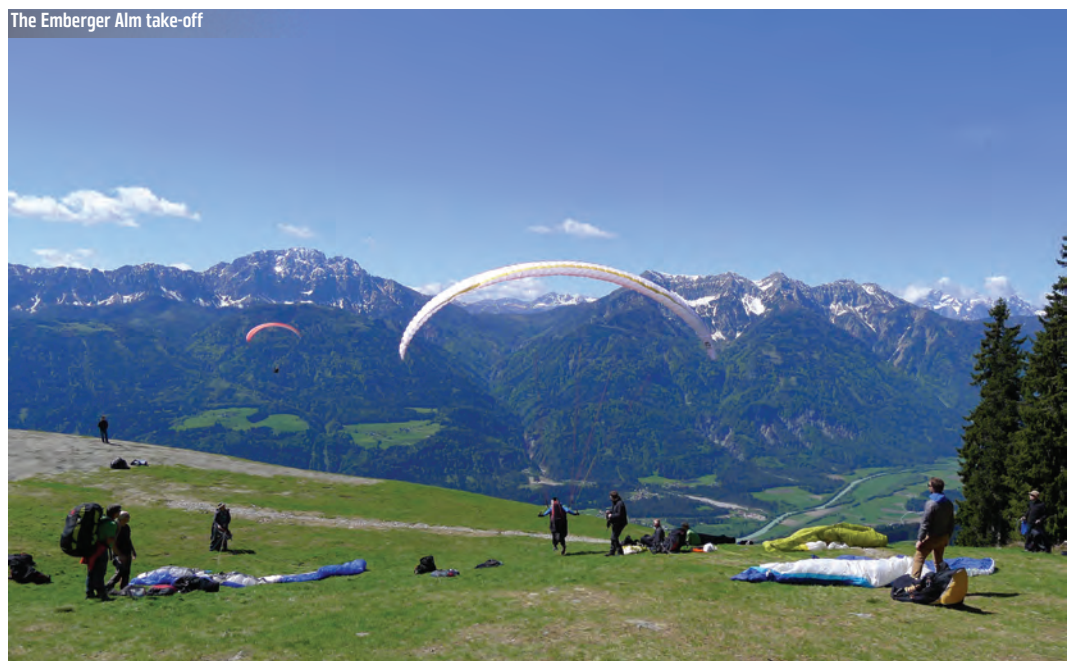
The Emberger Alm take-off

familiarity with the local area and meteorological conditions will be useful during our week.